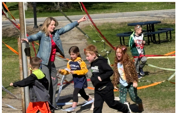
Getting a little too close to the May pole.