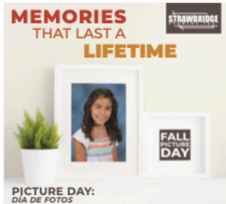
10/23/2024 Prescott Memorial School

HOT LUNCH MENU All breakfasts include Milk, Fruit or Juice All lunches include Vegetable, Fruit & Milk B - Breakfast ~ L - Lunch Mon. - NO SCHOOL - Indigenous People's Day Tues. - B - Maple Pancake Sausage & Cheese Sandwich or WG Pumpkin Bread Slice - L - Scurvy Dogs & Pirate Sloop Beans or Turkey & Cheese Sandwich Wed. - B - Mini Chocolate Donuts or Yogurt Cup - L - Choice A Cheese or Choice B Sausage Pizza or Turkey & Cheese Sandwich Thur. - B - Egg, Ham Cheese Bar or WG Apple Frudel - L - Golden Nuggets or Turkey & Cheese Sandwich Fri. - B - Ms. Dawn's Choice or WG Assorted Cereal - L - BBQ Cannon Balls over Noodles or Turkey & Cheese Sandwich Menu subject to change - milk available Student Breakfasts and Lunches are Free Adult Hot Lunch - $5.50